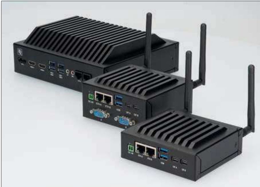
Figure 1. TQ industrial IoT platform concept addresses individual gateway, industrial firewall, edge server and AI solutions.