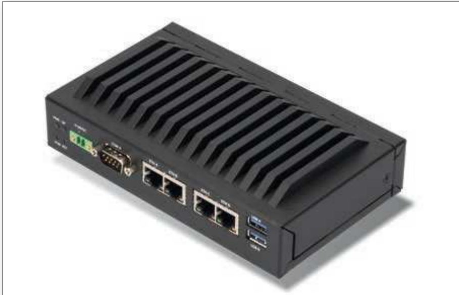
Figure 3. The MBox-ADV is equipped with four independent Gigabit Ethernet ports and is therefore suited for industrial firewall applications. The compact size and the robust housing addresses use cases within the harsh factory floor environment.