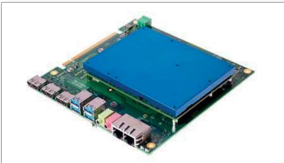
Figure 4. The carrier board MB-COME6-3 is designed for COM Express Type 6 modules and offers PCIe x4 and PCIe x16 high bandwidth connectivity to add-on cards which are used in high-performance AI solutions, for example.

so that the firewall deliberately works as a proxy, for example. Here, the firewall is not inserted invisibly into the communication path, rather it passes information as a proxy for the internal or external communications partner. Other important components of an industrial firewall include auxiliary functions such as automatic encryption/decryption of protocols such as ftp/sftp. This enables continued full use of older machines and systems over the course of Industry 4.0.