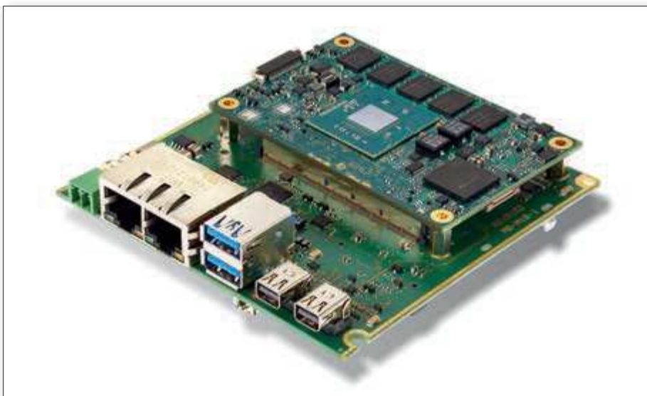
Figure 2. A modular approach enables scalability and flexibility. The TQ standard carrier board MB-M10-1 in combination with COM Express Mini modules like Intel Atom based TQMxE38M builds the heart of very compact, robust and powerful IoT applications.

of digitalizing systems and incorporating them into smart manufacturing concepts and Industry 4.0, Internet access often needs to be enabled as well. This lets the system manufacturer offer profitable auxiliary services such as predictive maintenance and service support. This is an important component for tapping additional business potential. Locally installed firewalls are used to cover the necessary security aspects. Often, standard IT firewalls are unsuitable for this purpose, because they have not been designed for the special needs in the industrial environment. This not only relates to their physical and electrical characteristics such as the housing, power